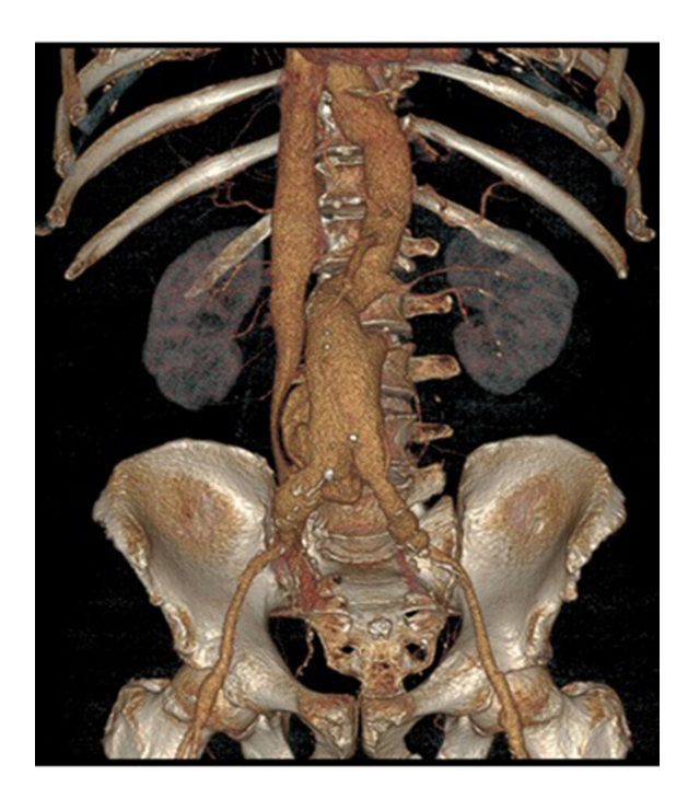
Figure 3. Volume rendering reconstruction of CT angiography. Contrast filling of the inferior vena cava in arterial phase is clearly seen.

cava ( Figure 2 ), and the lumen of the vein was homogenously enhanced in arterial phase ( Figure 3 ). The patient underwent urgent surgery with partial resection of the aneurysm and implantation of an aorto-iliac bypass graft. This case illustrates the broad and tricky differential diagnosis of renal colic and also the diagnostic capabilities of non-enhanced CT.