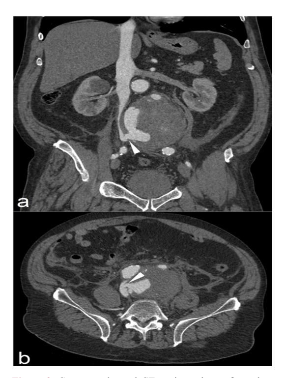
Figure 2. Contrast-enhanced CT angiography performed to evaluate the extent of the suspected aortic rupture. Images in A) the axial and B) the coronal plane offer direct evidence of aortic rupture with 5-mm-wide fistula to the inferior vena cava (arrows).

Received July 2017 & Accepted February 2018