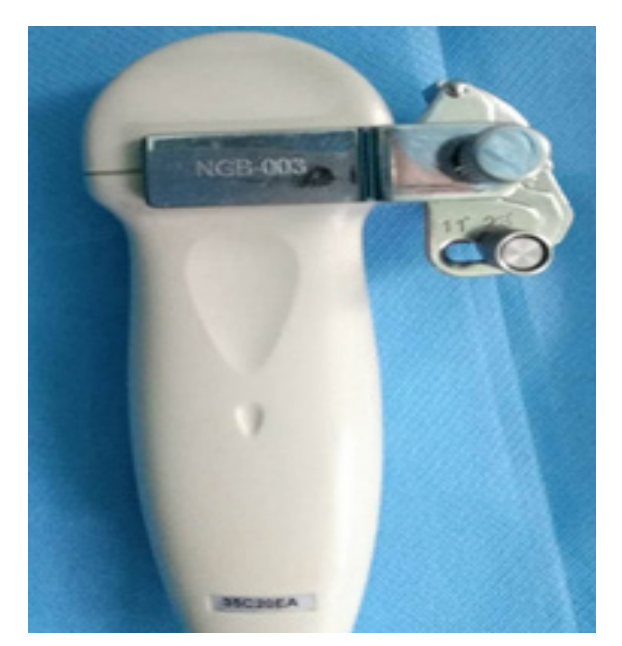
Figure 1. Ultrasonic probe and matching puncture frame.

All operations were performed under general anesthesia with endotracheal intubation. The patient was firstly placed in a lithotomy position, routinely sterilized and