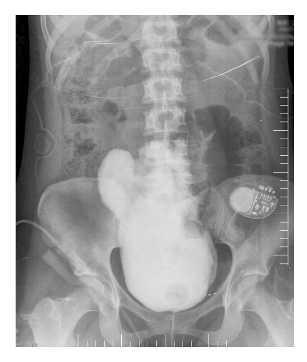
Figure 2.a ) voiding cystourethrography of the patient, full bladder with implanted tined lead and implantable pulse generator; b) her voiding cystourethrography demonstrating the residual urine after implanting the pulse generator.

a history of augmented cystoplasty who required clean intermittent catheterization (CIC).