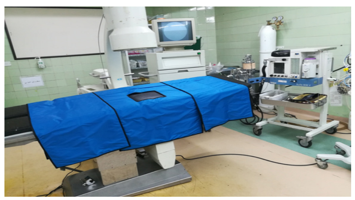
Figure 2. The protective lead layer designed in the new shielding method.

protective conditions (lead glasses and a simple cover on neck, trunk and lower extremities). First, 20 thermoluminescence dosimetry (TLDs) chips were set on various parts of the surgeon's body (legs, hands, chest, thyroid, and above eyes, with three chips on each part) and 12 chips on different parts of the patient's body (feet, chest, and thyroid). In order to locate TLDs in the desired areas, special TLD badges were designed (Figure 1). In the second stage of the implementation of the protective design, a layer of 0.5-mm-thick lead was fitted with a length of 1.8 m and a width of 1.2 m on the patient's bed. The protective shield was hanged from the patient's bed up to 50 cm in the surgeon's side and 10 cm in front of the surgeon. Also, a square hole with a length of 30 cm and a width of 30 cm was created in the protective shield of the lead to facilitate the operative procedure. For easier movement of the shield on the bed, it was designed in three sections. In order to better