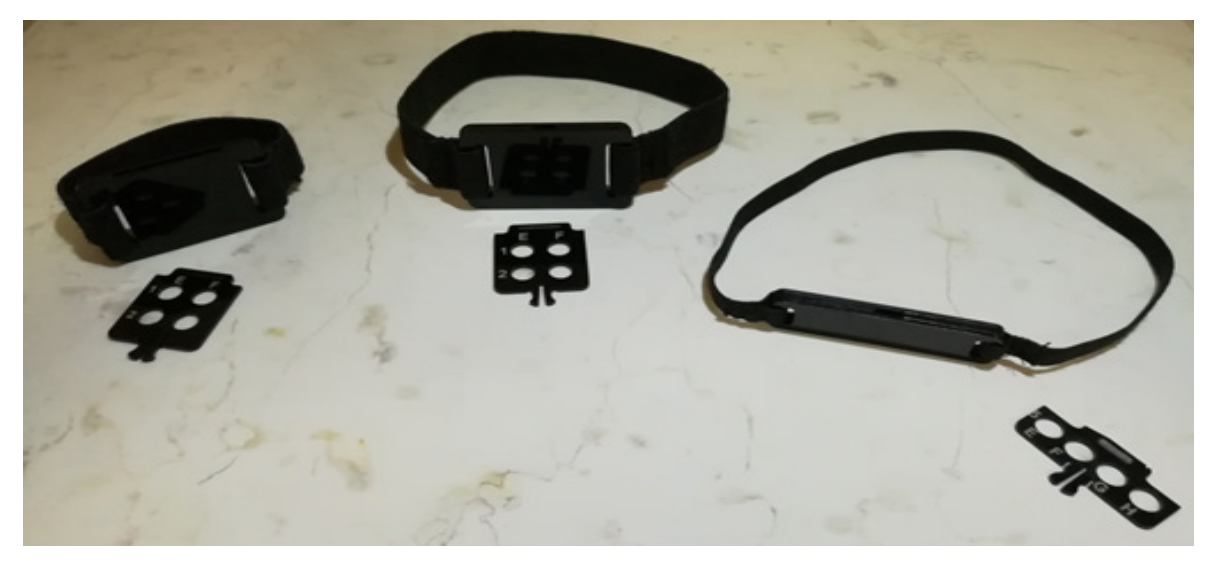
Figure 1. TLD badge opened up.

In the first group, the dose received by patients and surgeons during PCNL was considered under conventional