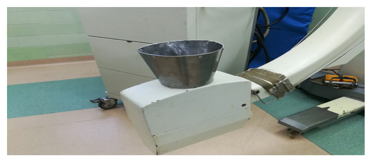
Figure 3. Fluoroscope tube with designed lead connector.

Descriptive analysis was used to describe the data, including mean \pm standard deviation (SD) for quantitative variables and frequency (percentage) for categorical variables. Chi square test, independent t-test and Mann-Whitney U test were used for the comparison of variables. For the statistical analysis, the statistical software IBM SPSS Statistics for Windows version 22.0 (IBM Corp. Released 2013. Armonk, New York) was employed. P -values <.05 were considered statistically significant.