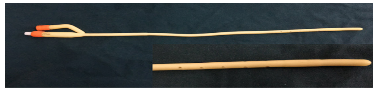
Figure 2. Photo of the new catheter.