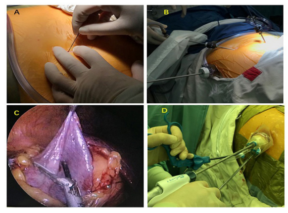
Figure 1. The Surgical technique of minilaparoscopic surgery and LESS. (A) Through a needle hole that made by a 14G syringe needle, a 3-mm trocar for the mini-laparoscope on the affected side of the abdomen were placed at the level of umbilicus on the midclavicular line. (B) Another 3-mm trocar for mini-laparoscopic grasper were placed on the abdomen near the surface projections of renal cyst. (C) With the help by 3mm grasper in left hand, an ultrasonic scalpel in right hand was then placed into the 5-mm trocar at the umbilicus to incise the posterior peritoneum and Gerota fascia. (D) In LESS, a single-port-access device was placed through the umbilicus. A 5-mm flexible laparoscope, a grasper and an ultrasonic scalpel were then positioned in this single-port-access device.