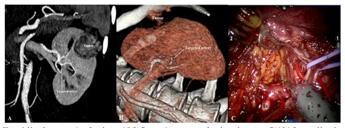
Figure 1. Vascular segmentation of renal artery A(left). Preoperative assessment of renal vascular anatomy. B(right). Segmental branches of renal artery feeding the tumor on 3-D CT imaging. C) Peroperative appearance of renal vasculature. (RA=Renal artery, PS=Presegmental artery, S=Segmental artery, RV= Renal vein, TA= Targeted artery)

All operations were performed by using da Vinci SI robotic surgical system (Intuitive Surgical, Inc., Sunnyvale, CA). Written informed consent was obtained from all the patients in this study which was approved by the institutional review board. A five-port transperitoneal approach was used for left-sided tumors. An additional 5 mm port was used for liver retraction for right-sided tumors (Figure 2). Following the endotracheal intubation under general anesthesia, a ureteral catheter was placed in patients whose tumor was too close to the collecting system. Then, the patient was placed in a 60^{\circ} modified flank position, and the pneumoperitoneum was achieved with a Veress needle at Palmer's point<sup>(17)</sup> for left renal tumors and 2 cm cranial from the midpoint between the umbilicus and anterior superior iliac spine for right renal tumors. The colon was reflected medial-