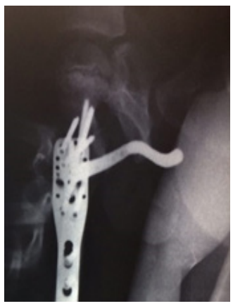
Figure 1. Blunt urethra in urethrogram and evidence of previous surgery.

After placing a cystostomy, he became a candidate to repeat urethroplasty (perineal end to end anastomotic urethroplasty). No bowel preparation and rectal washing was performed before the surgery. In lithotomy position, after perineal exploration, the urethra was found but because of adhesion and fibrosis band and difficult tissue dissection, the rectum was perforated about 5cm ( Figure 2 ). After washing the field of surgery with adequate amount of normal saline and replacement of surgical draping and instruments, we repaired the rectum with vicryl and silk sutures in 2 layers. Then urethroplasty was performed using the standard method. (5)