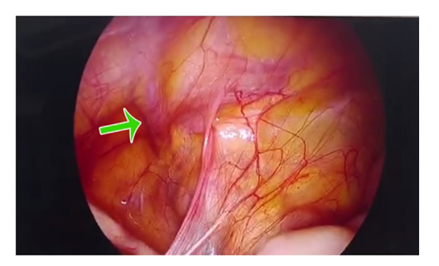
Figure 1. No testis in the right side of pelvic in laparoscopic view. Arrow shows right inferior epigastric artery

A three-year-old boy presented to our surgery clinic by a chief complaint of testicular absence. He was admitted for more diagnostic evaluation and therapeutic management. Patient's mother had no history of drug usage or X-ray radiation during pregnancy. She had another son without any medical problems. Parents were not