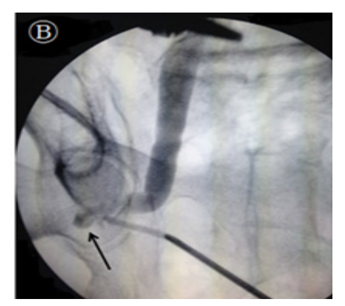
Figure 1. A. Computed tomography showed herniation of Rt. ureter into sciatic foramen (arrow). B. Retrograde pyelography showed 'curlicue ureter' sign of ureterosciatic hernia (arrow).

Department of Urology, Eulji Medical Center, Eulji University School of Medicine, Seoul, Korea. *Correspondence: Department of Urology, Eulji General Hospital, 68 Hangeulbiseong-ro, Nowon-gu, Seoul 139-872, Korea. TEL: +82-2-970-8306 FAX: +82-2-970-8517. E-mail: uro02@eulji.ac.kr.