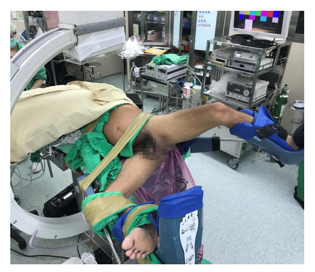
Figure 1. Lateral-frontal view of the patient with a left proximal ureter stone placed in the Galdakao-modified supine Valdivia (GMSV) position with the left leg in extension and the other in flexion. The C-arm and fluoroscopic instrument were placed contra-laterally to the left ureteral stone.

All patients underwent preoperative urine culture; serum biochemistry and routine blood tests; radiographic