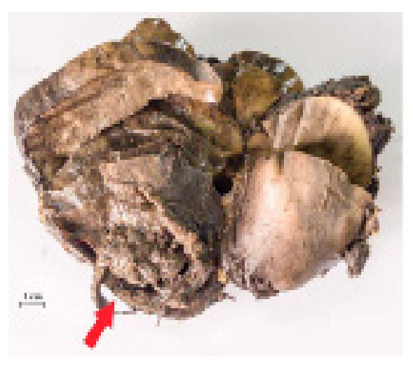
Figure 2. Kidney with site of rupture at upper pole(Arrow).

Received November 2017 & Accepted February 2018