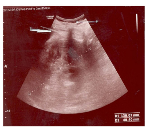
Figure 1. Ultrasound showed a 136*48 mm heterogeneous collection.

A 20 year old woman in the 20th week of pregnancy (Gravid 1, para1) referred to our center with severe generalized abdominal pain and flank pain. She described a history of 8 hours of severe, constant pain with sudden onset and radiation to the right flank that progressively aggravated. She did not have any predisposing factors or history