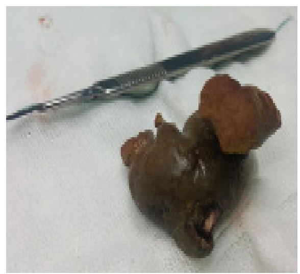
Figure 3. The extracted stone intact with a laparoscopic stone grasper.