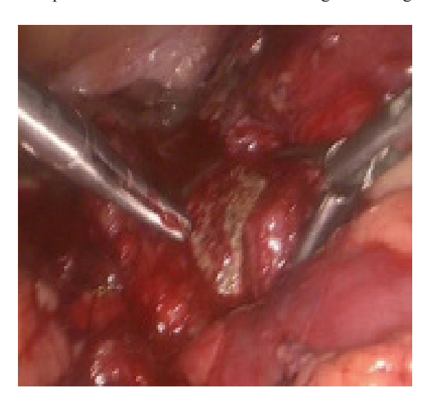
Figure 2. Twelve mm port site was dilated and the endobag containing the stone was extracted by using an Endobag.

in a pelvic kidney was described by Eshghi initially<sup>(8)</sup>.