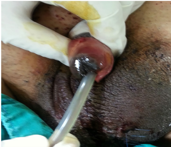
Figure 3. Ischemic, poorly perfused, black colored glans