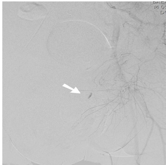
Figure 2. Left internal iliac artery angiography demonstrate active contrast leakage from left internal pudendal artery branch (arrow)