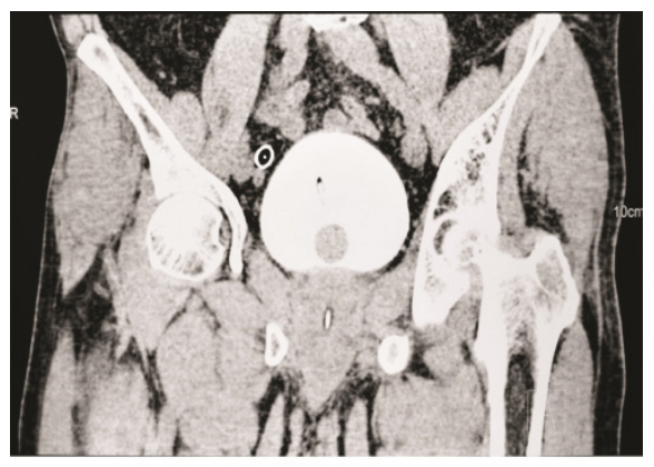
Figure 2. CT scan showing intraperitoneal localization of the thermometer and an absence of contrast extravasation from the bladder.

<sup>1</sup>Clinic of Urology, Clinical Center of Vojvodina, Novi Sad, Serbia.