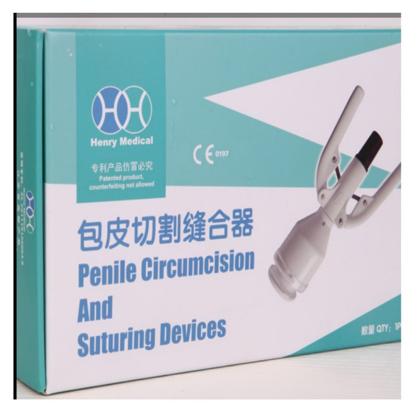
Figure 2. Daming disposable circumcision suture device.

the hospital for manual removal of staples.