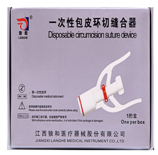
Figure 1. Langhe disposable circumcision suture device.

could be performed by scissors, followed by lifting the ostium praeputiale and placing the stapler onto the balanus. With the frenulum loosened, the bell handles was spanned to the back of the frenulum, forming an angle of about 45°. Then the ostium praeputiale was fixed to the bell pole using tie, where the bell pole should be inserted into the center of the housing carefully. The adjustment knob was installed and tightened clockwise to align to end of bell pole with the top of adjustment knob. The safety catch was removed; the handles were hold for 15-20 seconds and then released. The adjustment knob was turned counterclockwise and the bell stand was removed. The adherent foreskin was cut off. The entire bell stand was detached and the circular anastomotic site was pressed for 2 min, followed by pressure bandaging of the surgical wound. The pressure bandage was opened 3 days after surgery, and the wound was cleaned every day until healing<sup>(6-8)</sup>.