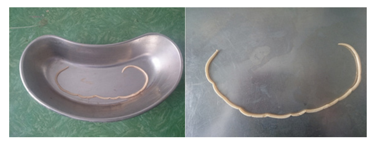
Figure 1. Adult male Dioctophyme renale (30 cm long) removed from in the right kidney of a 75-year-old man

Although animal infection with this parasite occurs in Iran, but human infection rarely in this country. Dioctophymatosis has been reported from Iran<sup>(8)</sup> and other parts of the world.<sup>(4,6,7,9,10,11)</sup> In this study, we report a case of human infection with D.renale in an old man from the Bijar city of Kurdistan Province, Western part of Iran.