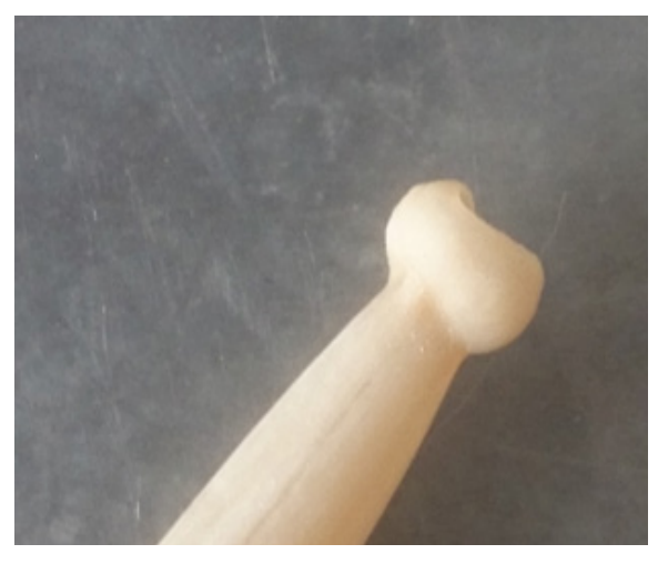
Figure 2. A bell-shaped copulatory bursa of adult male worm