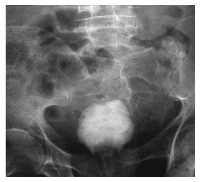
Figure 2. Cystography after 5 weeks of catheter insertion.

The most common cause of rupture of the urinary bladder is trauma. Nontraumatic rupture is known as spontaneous rupture. Causes of spontaneous rupture include bladder wall lesions (malignant tumor, inflammatory lesions, and irradiation) or distention of the bladder wall (neurogenic bladder, outlet