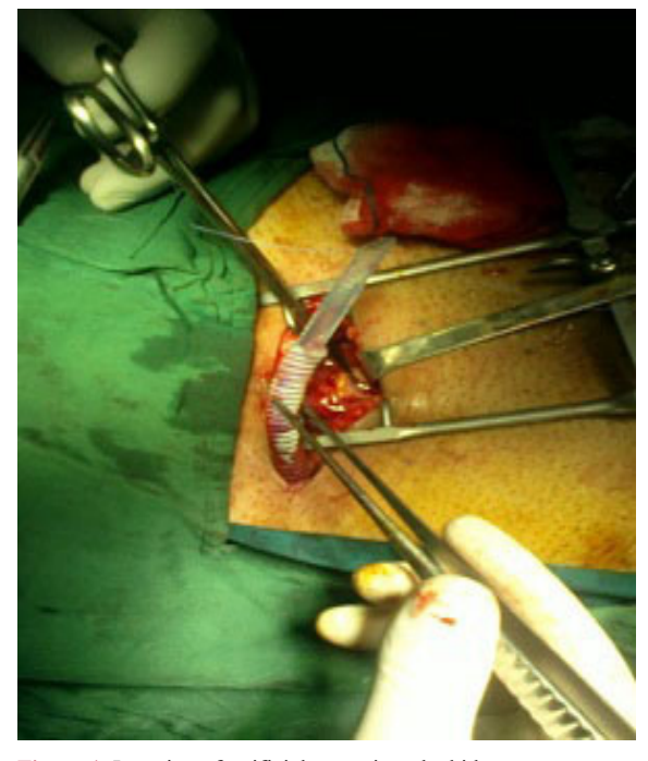
Figure 1. Insertion of artificial ureter into the kidney.

Of the 17 cases who received the AU, nine were secondary to cancer and radiation therapy, five had allograft anastomotic stricture, and three cases were post-