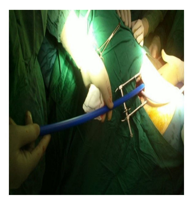
Figure 2. Subcutaneous bypass of the artificial ureter.