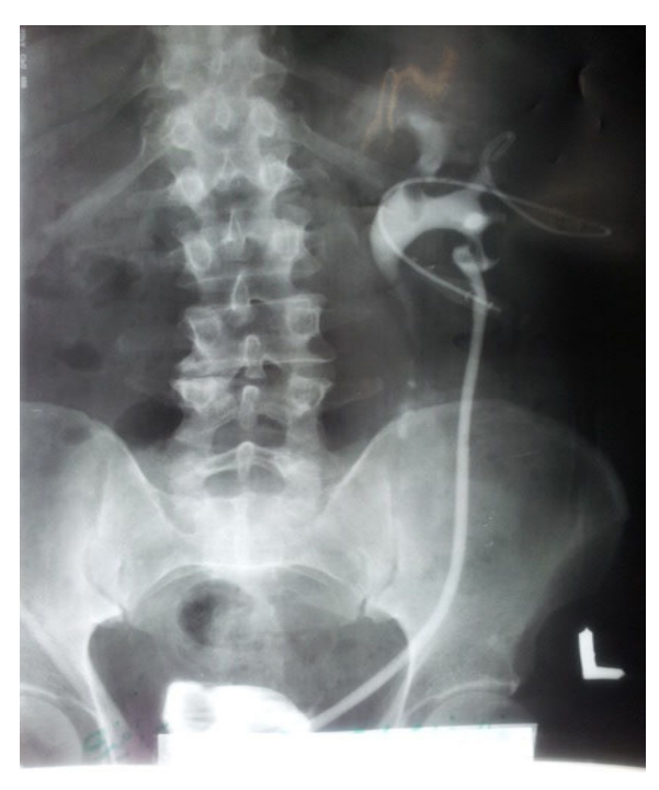
Figure 4. Nephrostography in a patient after radiation therapy: ureteral obstruction is clear.

tion and closure. AU may be considered for a selected population of patients with ureteral injuries after failure of primary repair or when open surgery is likely to be hazardous because of general conditions. It should be emphasized that this procedure is not recommended as an initial attempt after ureteral injury but only when open surgery for repairing the ureter fails and there is no other way to save the ureter. Antireflux devices and peristaltic mechanisms are not necessary.<sup>(7-9)</sup>