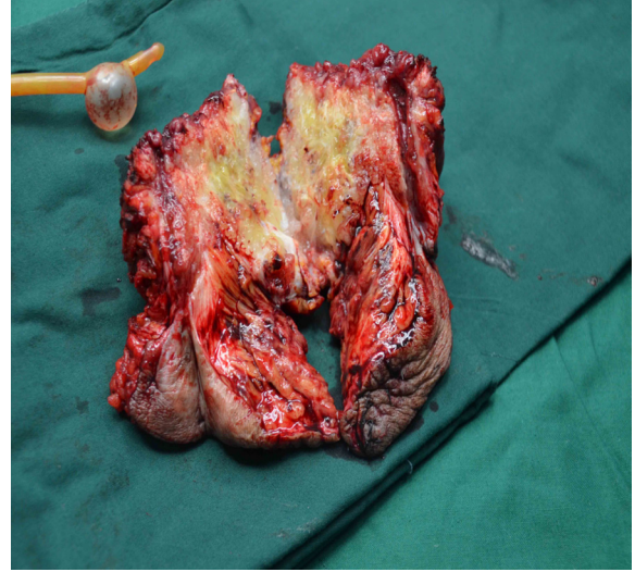
Figure 2. Wide excision of suprapubic tube, mass, and partial bladder.

Department of Urology, Beijing Jishuitan Hospital, Beijing 100035, China.