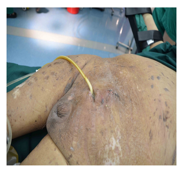
Figure 1. suprapubic mass at presentation.

The patient presented with new-onset gross hematuria and severe fever. In order to identify the source of hematuria, contrast enhanced computed tomography of the abdomen and pelvis were conducted. On the computed tomographic scan of the abdomen and pelvis, a tumor mass surrounding the suprapubic cystostomy tract was clearly visible. Physical examination revealed a hard, erythematous, and inflamed lesion in the abdominal wall envel-