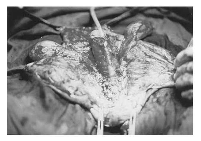
FIG. 3. Testes, spermatic cord and penis have been separated from the surrounding involved tissue through two longitudinal and spiral incisions.