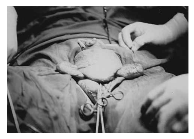
FIG. 2. Freeing of testes and spermatic cord from the surrounding involved tissue through a horizontal incision on posterior part of the scrotum