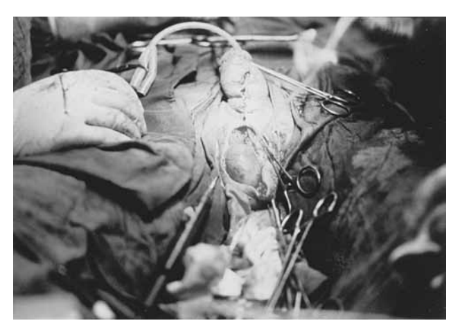
FIG. 4. Scrotoplasty and Z plasty in order to construct the cover of penis following extensive debridement of the involved tissue