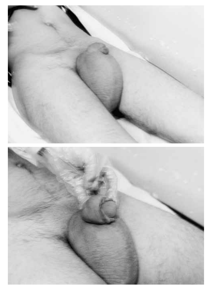
FIG. 1. Lymphedema or elephantiasis of penis and scrotum

Abdominal and pelvic CT scan, as well as CBC, U/A, ESR and blood biochemical tests were normal. Serologic study was negative for filariasis. With the diagnosis of idiopathic elephantiasis of penis and scrotum, surgery was planned in which extensive debridement of the involved tissue, scro-