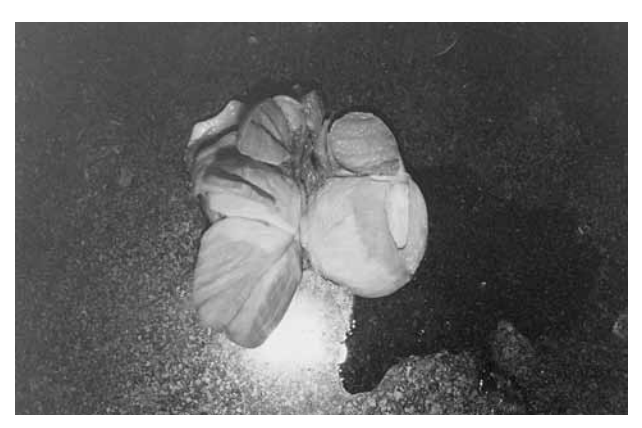
FIG. 1. Gross appearance of the tumor

Accepted for publication in August 2003 *Corresponding author: Department of Pathology, Shaheed Labbafinejad Medical Center, Boustan 9, Pasdaran, Tehran, Iran. Postal code: 16666. Tel: +98 21 2549010-16, Fax: +98 21 2549039.