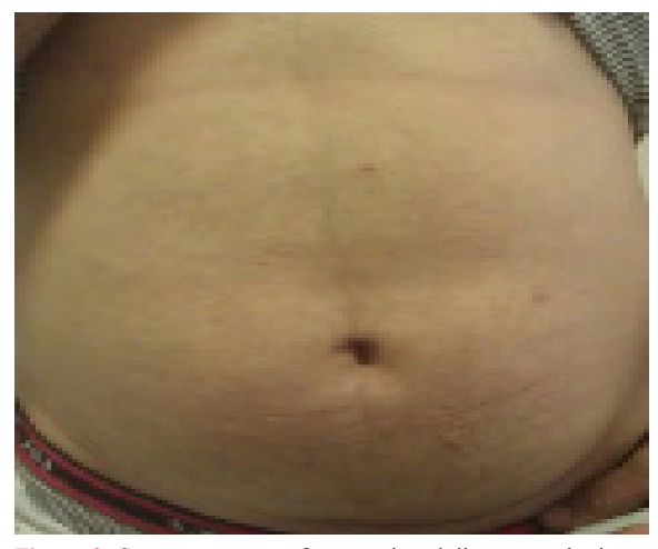
Figure 3. Scar appearance of trocars in minilaparoscopic donor nephrectomy after three months.

loss was negligible in both groups. Mean hospital stay was similar between the two groups [2.1 (2-5) vs. 2.4 (2-5) days: P = .346]. Mean follow up time of recipient was 9 months (6-19 months). Kidney graft function; assessed by serum creatinine values (mg/dL) of recipients one month after transplantation and then every three months, was equivalent in both groups (1.58 vs. 1.86; P = .206). Two grafts were lost in recipients of sLDN donors, while only one was lost from mLDN donors. Rejection was the main reason of graft loss in all three aforementioned cases. There were no fatalities resulting from either procedure in donors. There were no cases of conversion to open surgery, vascular injury or graft extraction complication in both groups. No major peri- or post-operative complications occurred in both groups. Two patients in sLDN group and three patients in mLDN group had complication with Clavien Dindo grading type II (fever greater than 38.5°C longer than 48 hours that were managed by antibiotic therapy) (P =.527) (Table 2). PASQ is a validated questionnaire for the measurement of scar outcome and consists of five subscales. Mean appearance score and consciousness score a showed significantly better results in the mLDN group (Table 3) (Figure 3).