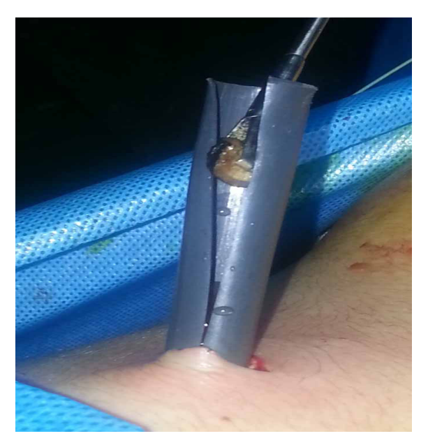
Figure 2. A large stone fragment is extracted from the split Amplatz sheath.

postoperative data. The mean operative, fluoroscopy and lithotripsy times in group one (intact sheath) were significantly longer than group two (split sheath). The mean size of extracted stone fragment in group one was significantly smaller than group two. (Figure 2) Hemoglobin change was not significantly different (p = .54) ( 2.52 \pm 1.2 in the split group vs. 2.35 \pm 1.07 in intact group). There was no significant difference in mean change of serum sodium (Na), potassium (K), and creatinine between the two groups. (Table 2) Stone free rate was not significantly different between the two groups (83.3% vs. 88.1% in groups 1 and 2, respectively) (P = .5). However, in staghorn stones and stones larger than 1000 mm<sup>2</sup>, stone free rate in group 1