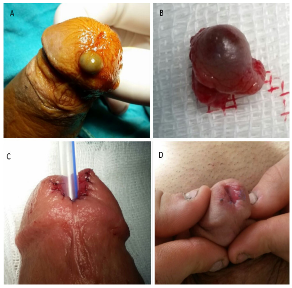
Figure 1. (A) The cyst at the parametrus of the penis of a 26-year-old patient. (B) The image of the cyst after the complete excision. (C) The image of the meatoplasty. (D) The image of the penis after the catheter removed.

A 26-year-old male presented with a mass on the penis that had been growing slowly for 3 years; although the mass was painless, it caused discomfort during urination and sexual relations. In the physical examination, a penile mass 20 \times 20 mm in size with regular borders was determined to be extremely close to the external meatus ( Figure 1A ). Except for the penile lesion, the physical and abdominal examinations were normal. The full urine test and full blood count results were normal. By penile ultrasonography, a cystic mass, 10 \times 20 \times 20 mm in size, was determined. Under spinal anaesthesia, the mass was excised, and meatoplasty was performed ( Figure 1B, C, D ). The patient was discharged on postoperative day 1. In the pathology examination, there was cyst formation in the hematoxylin-eosin staining, with a lining of pseudostratified columnar epithelium in the deep dermis under a normal epidermis ( Figure 2A ). Focal squamous metaplasia in the pseudostratified columnar epithelium could be observed. In the immunohistochemical study, the epithelial cells of the cyst lining were stained positive with cytokeratin (CK) 7 ( Figure 2B ) and carcinoembryonic antigen (CEA) ( Figure 2C ) and negative with cytokeratin 20 ( Figure 2D ). The lesion was diagnosed as an MRC from these findings. At the 1-month follow-up, the complaints