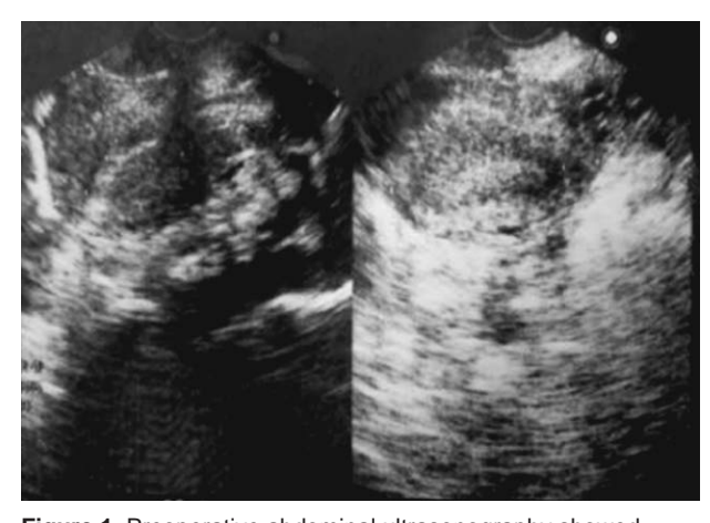
Figure 1. Preoperative abdominal ultrasonography showed a focus of soft tissue with the size of 31 \times 14 \times 11 mm in the posterior bladder wall.

Received January 2008 Accepted July 2008