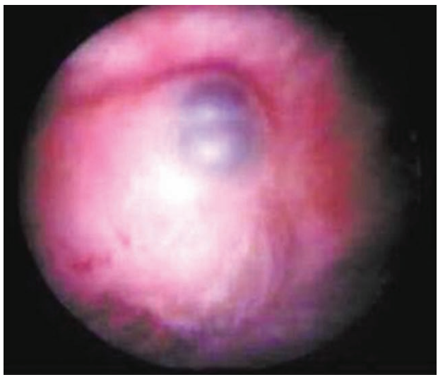
Figure 3. The patient's cystoscopic feature of the disease: a sessile irregular bluish lesion with a nodular surface on the posterior wall of the bladder.

The pathologic findings revealed endometriosis in the bladder with chronic bullous cystitis. The macroscopic size of the mass was about 2 \times 2 \times 0.5 cm. Microscopic features demonstrated urinary bladder mucosa with stromal edema, hyperemia, mild chronic inflammatory cell infiltration, and foci of endometrial glands and stroma (Figure 4).