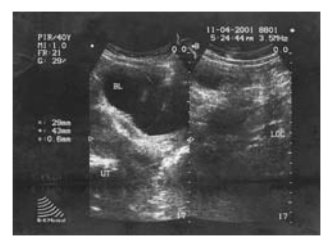
FIG. 1. Premenstrual transabdominal median longitudinal ultrasound scan of pelvis. The bladder has normal appearance.

Received December 2003 Accepted May 2004 *Corresponding author: P.O. Box: 19395-1849, Tel: +98 912 109 5200, E-mail: safarinejad@unrc.ir