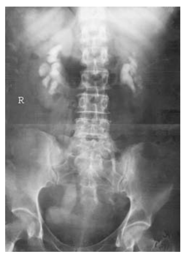
FIG 3. Intravenous urogram demonstrating left sever hydroureteronephrosis with normal drainage of right system

Endometriosis of the urinary tract is rare, and the bladder is the most common site of involvement. Endometriosis usually occurs between menarch and menopause, because of the fluctuating levels of estrogen and progesterone