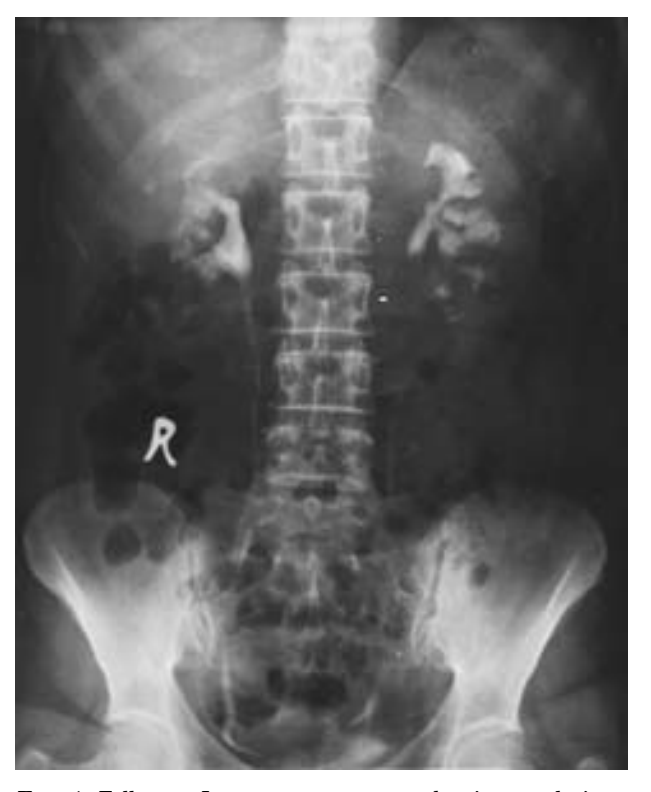
FIG. 4. Follow-up Intravenous urogram showing resolution of left upper tract dilatation after excision of the stricture and ureteroneocystostomy