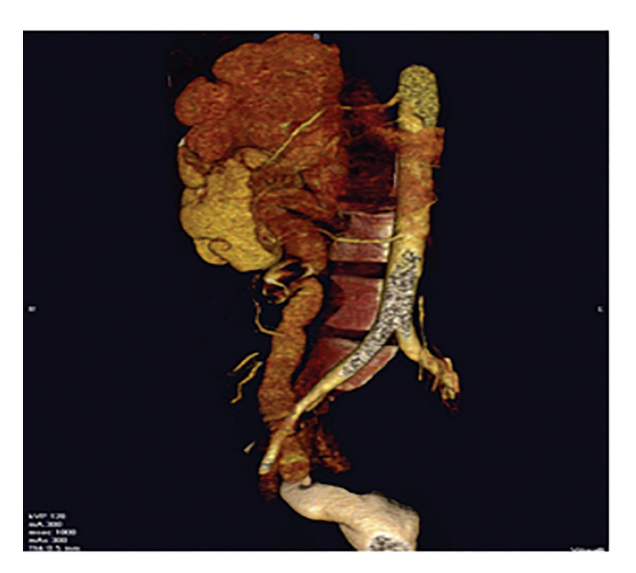
Figure 1. Three dimensional reconfiguration of computed tomography demonstrating the non-functioning upper pole moiety.

and voiding cystourethrography when necessary (Figure 1).