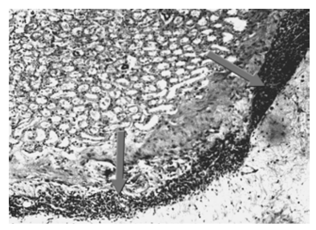
FIG. 1. Histopathology of the thymokidney. Note the normal thymic tissue (arrows) adjacent to the normal kidney tissue (hematoxylin-eosin \times 40).