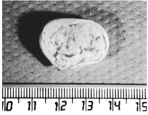
FIG. 1. Macroscopic appearance of the epidermoid cyst filled with pale pasty material

Received October 2005 Accepted November 2005 *Corresponding author: PO Box 12, Kingdom of Bahrain. Tel: ++973 3965 5977 E-mail: mddurazi@hotmail.com