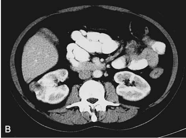
FIG. 2. CT scan with contrast-medium. A. a 2-cm tumor in the left adrenal gland, B. a mass on the external surface of the middle lobe of the right kidney