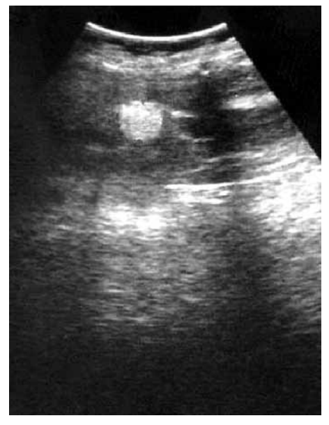
\mathbf{Fig.}\ \mathbf{1.}\ \mathbf{Ultrasonography}; a hyperechoic mass in the right kidney

Received April 2004 Accepted December 2005 *Corresponding author: Department of Urology, Shaheed Modarres Hospital, Sa'adatabad St, Tehran, Iran. Tel: +98 912 319 7306 E-mail: alka1384@yahoo.com