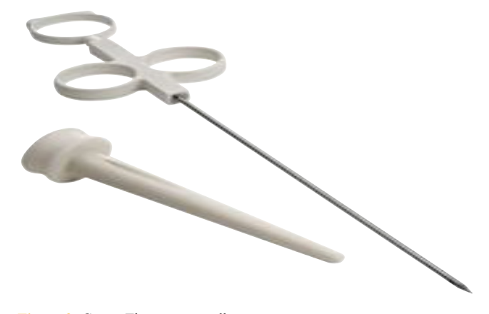
Figure 2. Carter-Thomason needle.