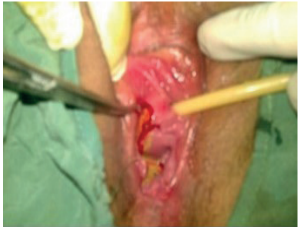
Figure 2. Incision and drainage of paraurethral cyst.