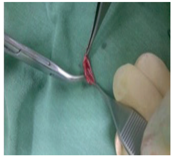
Figure 4. Anterior cyst wall.