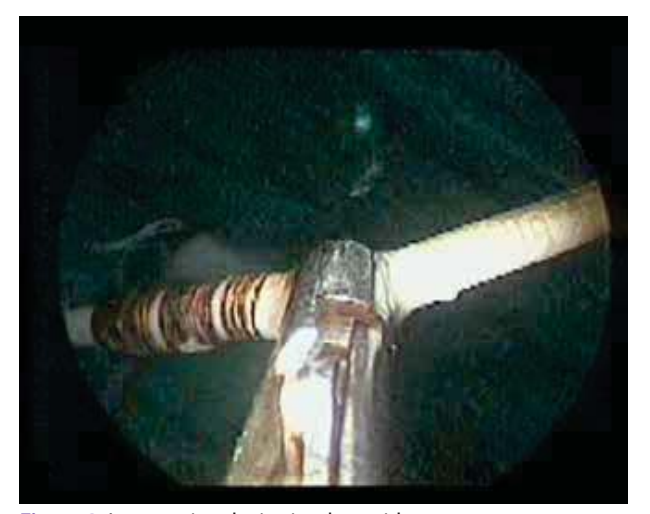
Figure 3. Intrauterine device is taken with grasper.