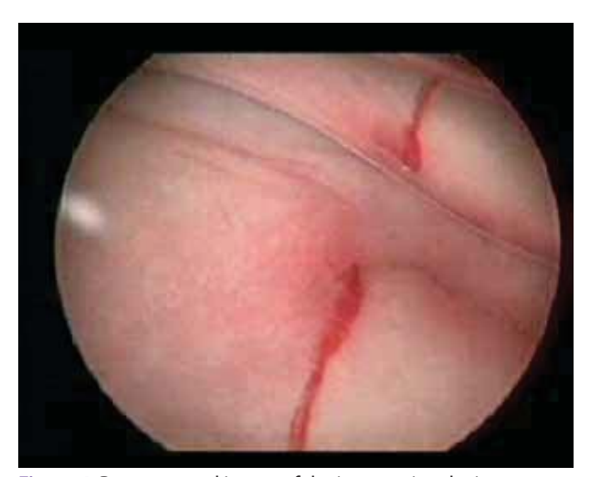
Figure 4. Post-removed image of the intrauterine device.

bladder. Intrauterine device was grasped with endoscopic forceps (Storz, Tuttlingen; Germany) and extracted with gentle traction (Figures 2 and 3). Bladder perforation that occurred at the end of the procedure was managed conservatively (Figure 4). There was no complication on the 1<sup>st</sup> postoperative day and had an indwelling transurethral catheter for 7 days with excellent outcome. The patient was constructed to attend annually for outpatient visits and to seek medical help if lower urinary tract symptoms recur.