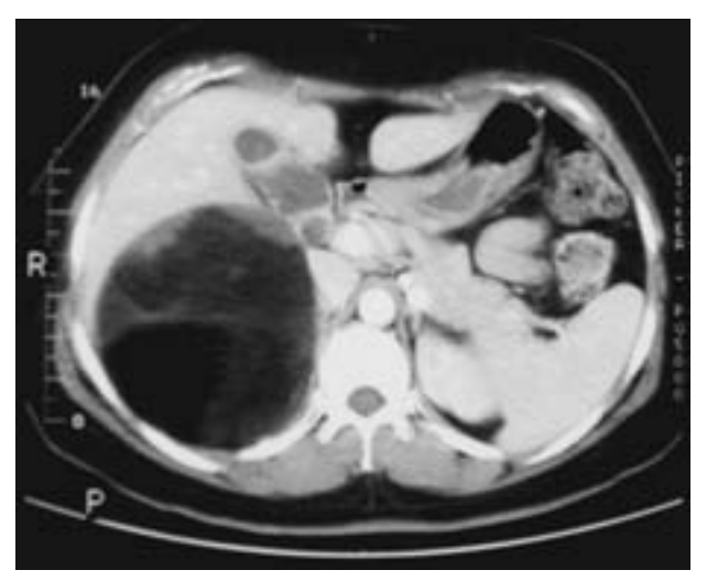
FIG. 1. Abdominal CT scan in a 37-year-old woman who presented to our department with vague right abdominal discomfort of 4 weeks' duration. The large adrenal mass is composed mostly of fat with well-defined borders.

Imaging. Most adrenal myelolipomas are asymptomatic. Symptoms associated with large myelolipomas are typically vague and include back or abdominal pain. Ultrasonography, CT, and MRI are effective in diagnosing adrenal myelolipomas in more than 90% of cases, with CT being the most sensitive diagnostic imaging modality.<sup>(12,13)</sup> Myelolipomas appear as welldelineated heterogeneous masses with low-density mature fat (less than -30 Hounsfield Units [HU]) interspersed with more dense myeloid tissue (Figure 1).<sup>(14)</sup> A fatty adrenal mass is virtually diagnostic of myelolipoma, although other less