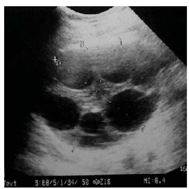
Figure 1. Longitudinal ultrasonography demonstrates a multicystic lesion in the upper pole of the right kidney. Calipers indicate approximate size of the lesion.

agglutination were performed, which had positive results. The patient was candidate for surgery. Kidney-sparing pericystectomy was performed, and the cyst was removed. The surgical specimen was occupied with considerable numbers of daughter cysts (Figure 3).