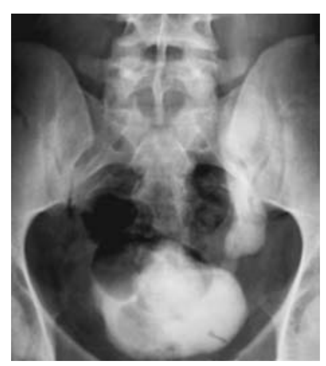
Figure 4. Postoperative voiding cyctourethrography demonstrated no remained diverticula.

of a segment of the urethra or the attachment of a structure to the urethra by a narrow neck (ie, a Mullerian remnant). (4) This condition, especially in men, is extremely rare and may be congenital or acquired. An acquired diverticulum usually forms due to infection, urethral stricture, and/or trauma. (5) Majority of the cases with PUD are of the Mullerian origin. The remainders are formed as a result of an aborted urethral duplication. The Mullerian remnants may be prostatic utricles or Mullerian duct cysts. (1) Prostatic utricles do not usually require any treatment, unless they become very large causing recurrent UTIs or other complications. (4) Mullerian duct cysts are cystic dilatations in the remnants of the distal ends of the fused Mullerian ducts. They rarely communicate with the urethra. If they are connected to the urethra, they usually enter the midline of verumontanum.(1)