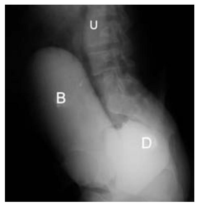
Figure 2. Lateral view of the bladder, the diverticulum, and the left ureter. B indicates the bladder; D, diverticulum; and U, the ureter.

prominent, our effort to find the right ureteral orifice was not successful. Posterior urethral valve (PUV) was not detected in our evaluation.