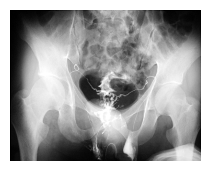
Figure 2. Vesiculography showed bilateral obstruction at the level of the ejaculatory duct. Left seminal vesicle was not shown and leakage of contrast from the right seminal vesicle to the perineal drain via the posterior lesion of the urinary bladder was demonstrated.

raphy have also been used. In general, vesiculography MRI of the seminal vesicle are alternative diagnostic tests for low ejaculate volume. In our case, these examinations were useful for diagnosis of SVF and scrutiny around the seminal vesicle. The reported treatment modalities for SVF are conservative treatment, (2,5,8) surgical drainage (transurethral unroofing, (9) transperinael approach, (7) percutaneous approach (4,6) and laparotomy and excision of the culprit lesion. (1) When excision of the culprit lesion is difficult, colostomy is a valuable tool for treatment. In our patient, the abscess gradually healed, the semen volume increased and spermatozoa appeared in ejaculate after the surgery.