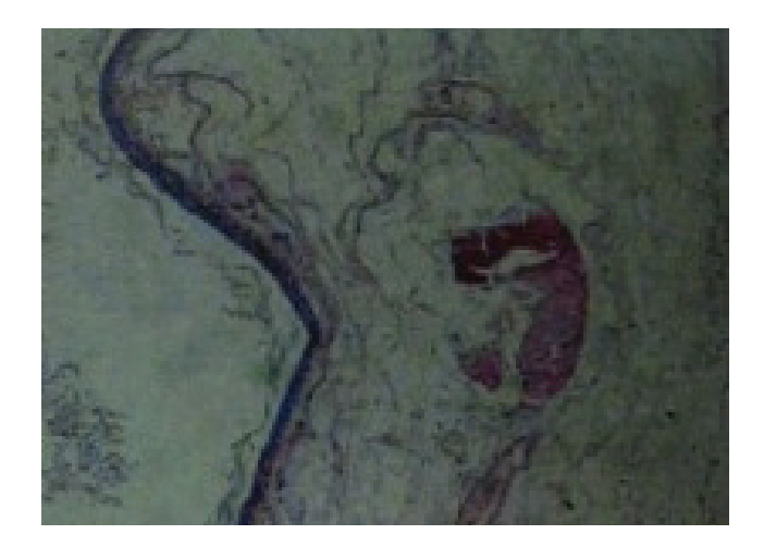
Figure 2. Hematoxylin and eosin staining of the specimen revealed a typical epidermoid cyst that was lined with stratified squamous epithelium (40×10).

Epidermoid cysts are usually asymptomatic, although symptoms may occur when the cysts are large. They may become infected, or uncommonly, they may rupture, causing a foreign body reaction. Symptoms of flank pain, dysuria, or gross hematuria are able to happen in patients with renal epidermoid cysts. (1) Results of routine laboratory tests are usually normal and not diagnostic. Keratinized material in a urine sample may suggest an epidermoid cyst in the urinary tract. (2) Epidermoid cysts, which are true congenital primary mesothelial cysts, have an epithelial or mesothelial cell lining, and are thought to be developmental in origin. Different theories have been postulated for the presence of epidermoid cyst in extraordinary sites such as kidney, spleen, brain, and ureter. In the kidney, it is suggested that this type of cyst could originate from the embryonic remnant of Wolffian ducts. (2) In this patient, the cyst may have arisen from surgical implantation of epidermal tissue secondary to perianal abscess surgery. On US, the classic appearance is typically alternating of avascular hyperechoic and hypoechoic rings, which was described as an onion-ring pattern. On CT scan, epidermoid