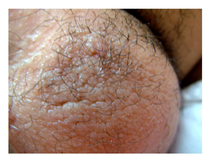
Figure 1. Multiple vesicles with oozing serous fluid on scrotum.

of papular lesions exhibited papillated epidermal hyperplasia secondary to lymphedema and dilated characteristic of lymphangiectasia which was filled with eosinophilic proteineous substance [LC disease] (Figure 3). The patient was searched for etiology of edema of lower extremities. The hematological and biochemical parameters of the patient, urinalysis and urological examination were within normal limits. There was no abnormality in abdominal ultrasonography, and venousarterial color Doppler ultrasonography of both lower limbs and testicles. But lymphoscintigraphy of lower limbs was confirmed the delaying and extremely impairment of lymphatic flow. So, this patient was diagnosed as MD in the light of his medical history and in the evidence of lymphoscintigraphy. At last, we diagnosed that this case was consistent with MD associated with LC and we treated the scrotal infection with appropriate antibiotic therapy. Scrotal edema was regressed and tenderness was vanished. Conservative treatment without surgical approach was preferred because of mild symptoms of the patient.