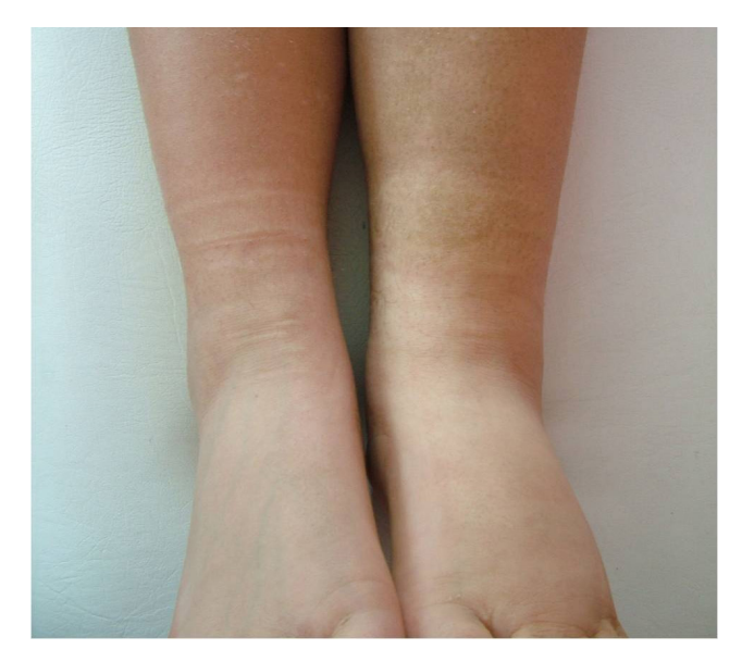
Figure 2. Edema has been progressed to upside of left leg.

Lymphatic vascular insufficiency is a widespread problem in the adult population, but rare in the childhood. The lymphatic vessels mediate immune responses in inflammatory disease, whereas dysfunction of the lymphatic drainage leads to lymphedema and infection. Primary lymphedema is a hereditary condition arising from an abnormality of lymphatic de-