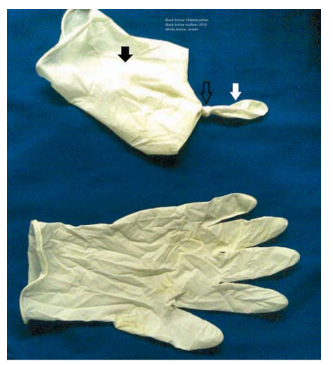
Figure 1. "Latex glove" laparoscopic pyeloplasty model

To determine the construct validity of the model, the procedure was performed by five operators. The operators were divided from the most experienced, with more than 20 LPPs to the least experienced, with no experience of laparoscopic procedure, having basic knowledge of suturing