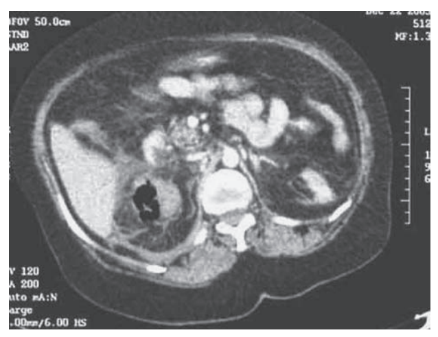
Figure 3. Nonenhanced CT scan of the same patient shows emphysematous pyelonephritis of the right kidney.