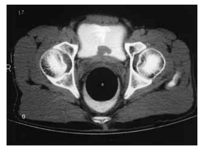
Figure 1. Computed tomography scan revealed an intravesical polypoid mass with small multiple calcified spots within the contrast-filled urinary bladder lumen.

Computed tomography scan revealed an intravesical solid