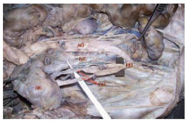
Figures 2 and 3. Incomplete double ureter (Y-shaped) in a male cadaver, which joined in the middle of the duplex system only on the right side. RK, indicates right kidney; IVC, inferior vena cava; AO, abdominal aorta; DU, double ureter; and RU, right ureter.