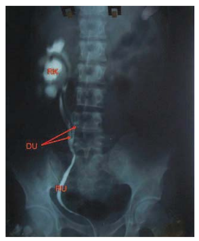
Figure 4. An intravenous pyelogram of a 43-year-old man with incomplete double ureter along with duplex system on the right side. RK, indicates right kidney; DU, double ureter; and RU, right ureter.

the posterior surface of the urinary bladder.