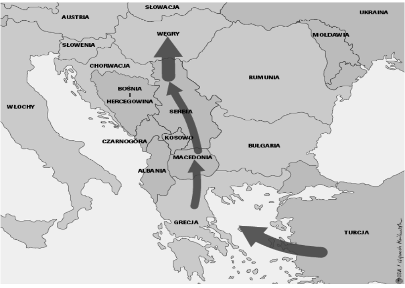
Map 2: The new channel of migrations