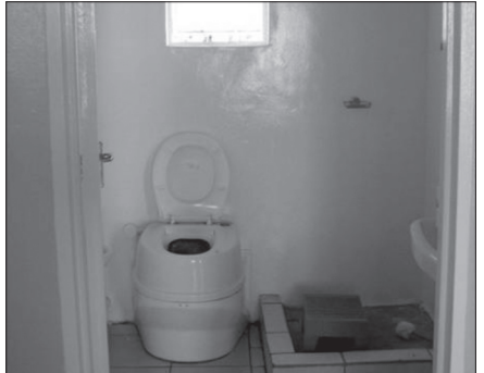
Figure 8: Source: