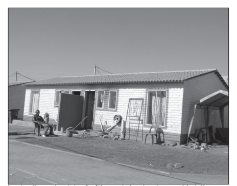
A variety of building types in Pennyville, including double (left) and single storey (right)

projects, for example Amalinda and Sakhasonke, have visible access points into the development that are overlooked by buildings, and some of these access points are controlled. Pennyville