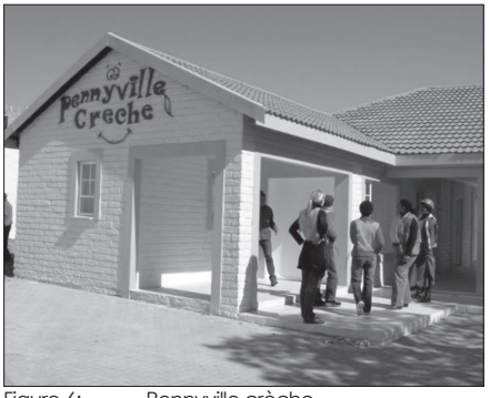
Figure 6: Pennyville crèche

This refers to places that strike a balance between the natural and man made environment and utilise each environment's intrinsic resources, as related to the climate, landform, landscape and ecology – to maximise energy conservation and amenity. Efficiency would therefore imply buildings that can meet different needs over time, sufficient in size, scale and density and the appropriate design to support basic amenities in the development or neighbourhood to ensure efficient use of land, materials and energy.