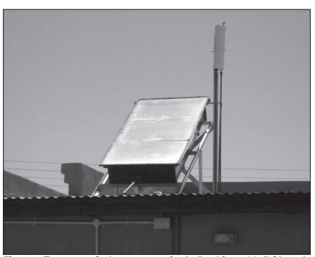
Figure 7: Source: