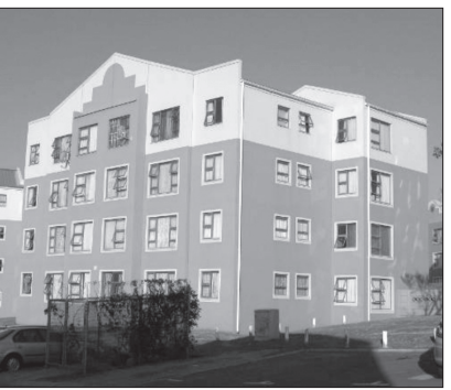
Figures 2 & 3: A variety of unit and building types in Amalinda, including three- and four storey walk-ups

amenities and facilities are available in close proximity or obtainable through various modes of transport. All five of the case studies are on well-located sites close to a range of social and economic opportunities or close to public transport facilities. Access to public transport in Amalinda is facilitated with mini-bus taxis that drive through the development, while Pennyville is located opposite a major train station with a number of taxi ranks within walking distance. The Highgate shopping centre and other services such as schools are located in the surrounding areas. The smaller or more compact