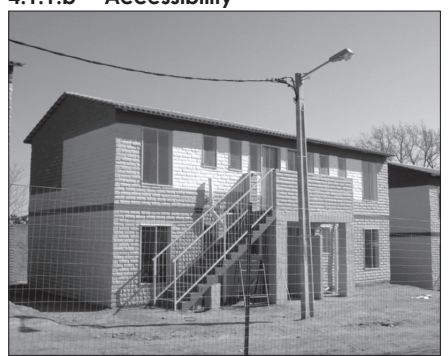
Figures 4 & 5: A variety of building types in Pennyvill semi-detached RDP houses.

This refers to places with well-defined routes for various modes (vehicles, pedestrians and cyclists) and spaces that are easy to approach or enter through the provision for convenient movement without compromising safety and security. It also refers to an environment where basic services, infrastructure,