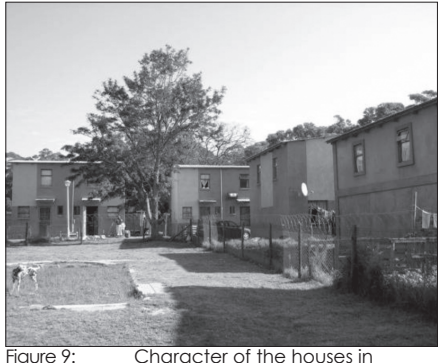
Figure 9: Charac Sakhasa

in adding value to the image of the development, which in turn attracts potential tenants, including slightly higher (lower-middle) income groups. In Pennyville, specific attention was given to the detailing of windows in the bonded houses, contributing to the aesthetic value of these houses. The houses in Sakhasonke (Figure 9) also boost the aesthetic appeal in that it gives careful attention to the painting (in various colours), variation of design and use of colour. In the Hull Street project, great attention was given to the aesthetic quality of the buildings and street appearance (Figure 10),