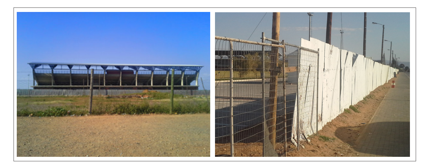
Figure 5: A view of the Bridgton Pavilion and its corrugated iron wall

The informal construction materials that constitute the majority of informal backyard rental dwellings further levy impacts on tenants, the broader community and the environment. The timber used as construction material in the majority of informal backyard structures in the case study is generally sourced from the discarded stock of local timber yards, with most of the fragments being tarred, releasing fumes and rendering structures highly flammable, according to an interview with Daughters (2015). Informal backyard rentals have been branded as fire risks in the literature (Crankshaw et al.,