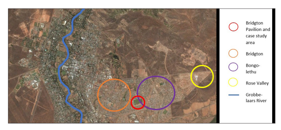
Figure 1: The town of Oudtshoorn and the Bridgton/Bongolethu case study

and other relevant experts, cited with pseudonyms throughout, who provided more nuanced information and supplemented shortcomings in the literature with regard to the local context. Secondly, data retrieved from a quantitative research survey distributed in the study area in 2013 provides statistical evidence. The survey was conducted by dispensing 101 questionnaires to residents of 101 properties surrounding the Bridgton Pavilion. Properties were included when home owners, or adult representatives, were home at the time of the survey and willing to participate. Prospective respondents were approached, informed of the purpose of the study and provided with general instructions. Informed consent was described in terms of the requirements of participation. Confidentiality statements and statements of voluntary participation