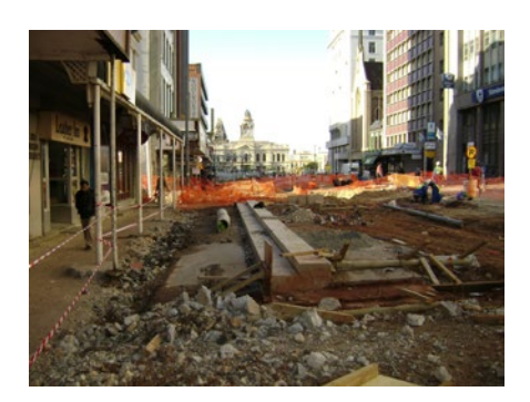
Figure 2: Upgrading of Govan Mbeki Avenue

Sustainability was a crucial consideration in the selection of infrastructure projects, the underlying ethos being that, "[i] f a public investment does not lead to downstream private sector investment, to sustain and deepen its role in the economic and social life of the area/city, then one cannot call it a successful public sector investment" (Voges, 2013: 154). The first of the MBDA's public infrastructure-led projects, the pedestrianisation of what was then a very decayed area, the one-kilometre long former Main Street in the Central Business District (CBD), now called Govan Mbeki Avenue, in 2006 at a cost of R95 million, is a good example of this approach (see Figures 2 and 3 indicating the work on, and result of the pedestrianisation of the street).