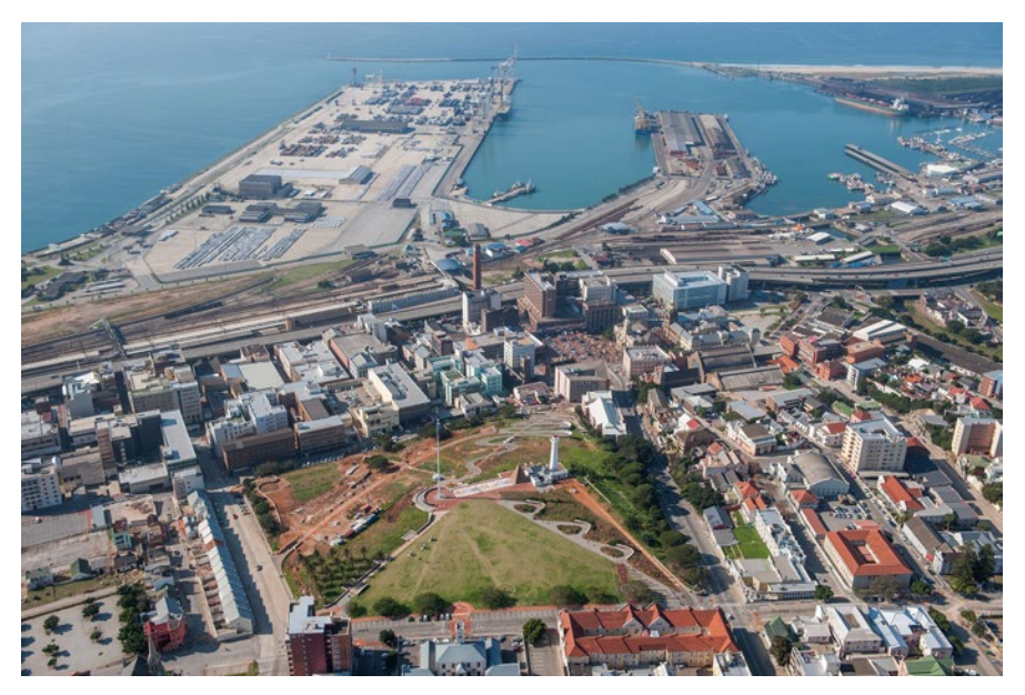
Figure 5: The Donkin Reserve upgrading