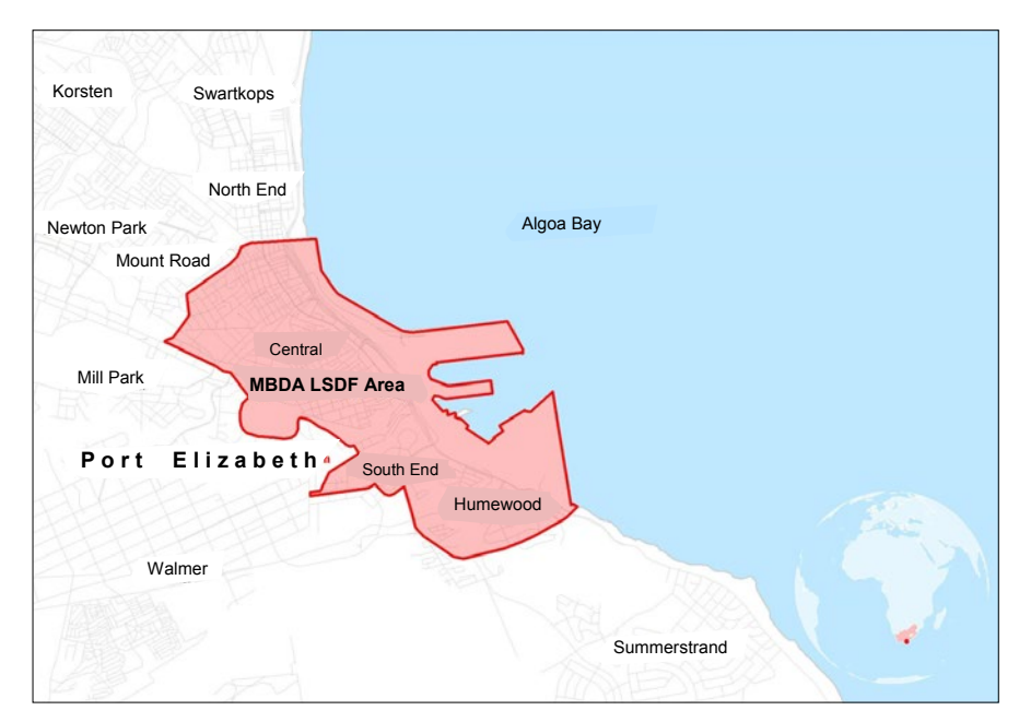
Figure 1: The MBDA's original 'Mandate Area' in the wider Port Elizabeth CBD area

As a first step, the MBDA, using a team consisting of architects, urban economists and consulting engineers, developed a 'Master Plan' with a series of very detailed projects to be implemented over a fifteen-year period (Voges, 2013: 134). These projects were conceived, developed and researched from a marketdemand, political, and social point of view, and with due cognisance of financial considerations. It was not only infrastructure that was considered and included in the plan, but also private sector-driven contracts (with service providers procured and managed by the MBDA) in areas such as security, cleansing, the regulation of informal trading, and the establishment of Special Rating Areas (SRAs). The resulting, overarching MBDA Master Plan was an approved City blueprint for urban renewal with local economic development benefits (Voges, 2013: 146). The overall objective was to conceptualise catalytic urban renewal infrastructure projects that would improve the quality of decayed public areas, and provide a platform for private-sector investment