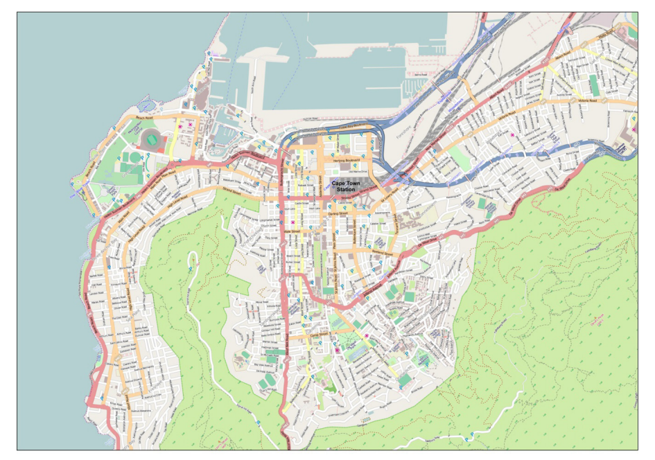
Figure 1: Cape Town's Central City.

Inclusive urban planning is at the heart of making the Central City Development Strategy a success. Exclusionary colonial and apartheid spatial planning is responsible for many of Cape Town's present challenges; developing a new way of planning must accordingly play a key role in shaping the city's integrated future. Since the launch of the CCDS in 2008, a series of new strategies and policies across the city have given rise to new planning possibilities, particularly in respect of the idea of sustainable densification. Documents such as the City of Cape