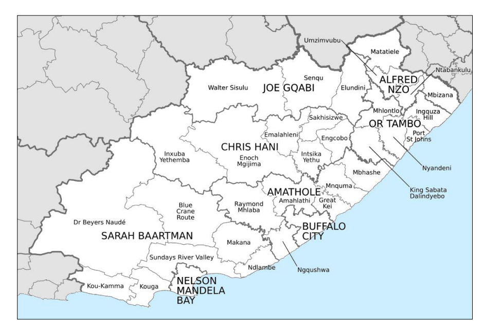
Figure 2: District and Local Municipalities of the Eastern Cape Source: Map drawn by the author, 2019

responsibility for municipal services and local development ( cf . Figure 2).